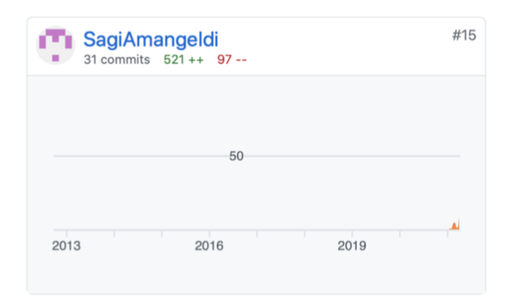
Fig. 4. Commits on the KISS project.

the inaugural forays into the OSS sphere are central. Identifying a project complemented by a conducive environment and collaborative contributors is illustrative for those aspiring to make impactful contributions. I was fortuitously aligned with a project characterized by an amicable lead and collaborative cocontributors. For neophytes in the domain, it's important to strike a balance between the zeal for unraveling novel technological facets pertinent to the project and ensuring their contributions remain germane.